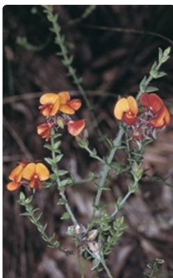
Flowers and leaves. Bomaderry Creek Regional Park near Nowra