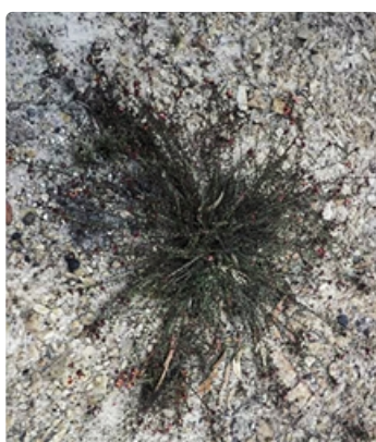
Shrub. Australian Plant Image Index, photographer S Donaldson, between Braidwood and Torrington