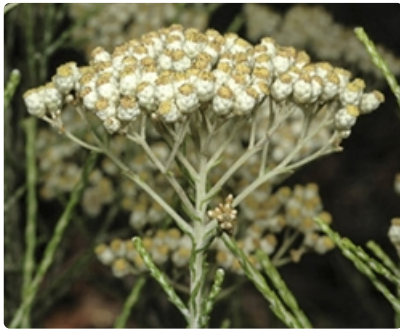
Cluster of flower heads.