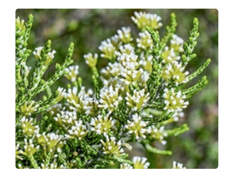
Flow ering branches. Photographer Maree Goods, Mt Buffalo, Vic