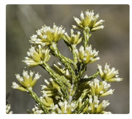
Flow ering stems. Kosciuszko National Park