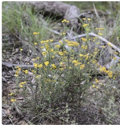
Shrub. garden escape, Black Mountain, Canberra, ACT.