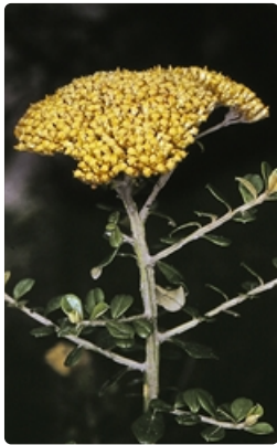
Flowering branch. Ben Boyd National Park south of Eden