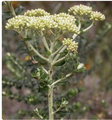
Flowering branch.