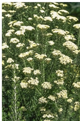
Flowering branches.