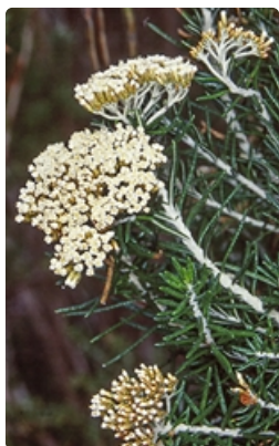
Flowering branches. Photographer Don Wood, Australian National Botanic Gardens, Canberra, ACT