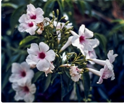
Flowers. Australian Plant Image Index, photographer Murray Fagg, Australian National Botanic Gardens, Canberra, ACT