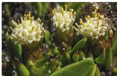
Flower heads and leaves. Bogong High Plains, Vic