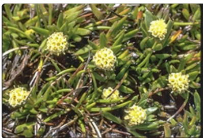
Mat. Australian Plant Image Index, photographer Colin Totterdell, Kosciuszko National Park