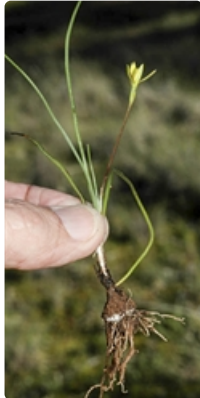
Flowering plant. near Stockingbingal, NSW