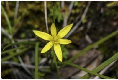
Flower and leaves. near Stockingbingal, NSW