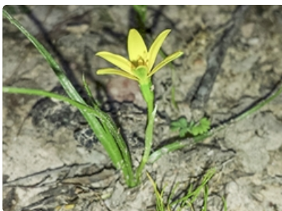
Flowering plant (var. vaginata ) NE of Daylesford, Vic