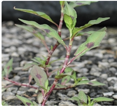
Leafy stems.