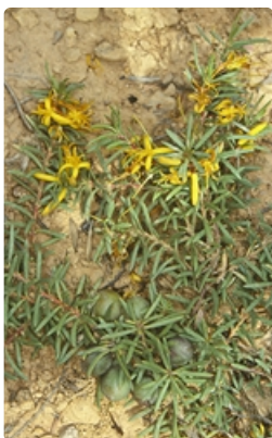
Flowering shrub with fruit. Mongarlowe east of Braidwood