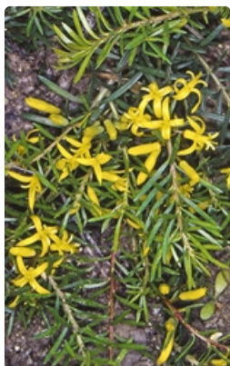
Flowering branches. Photographer Don Wood, Namadgi National Park, ACT