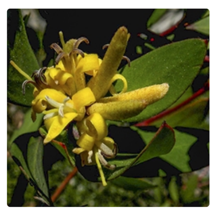
Rower cluster.