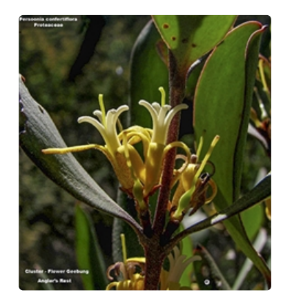
Flower cluster and leaves.