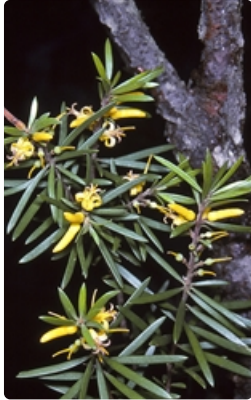
Flowering branches, trunk behind. Photographer Don Wood, Biamanga National Park north of Bega