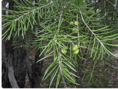
Fruiting branches.