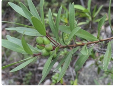
Stem with green fruit.