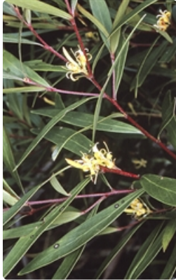
Flowering stems. Dampier State Forest west of Mbruya