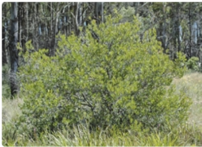
Shrub. Tallaganda State Forest west of Braidwood