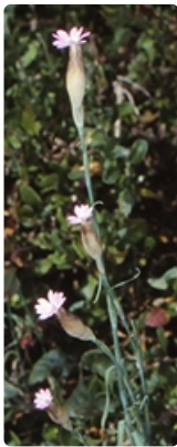
Flowering stems.