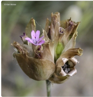
Flower heads with mostly spent flowers. Oregon, USA