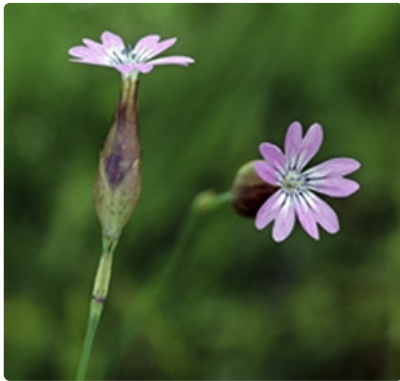
Flowers. Mt Majura Nature Reserve, Canberra, ACT