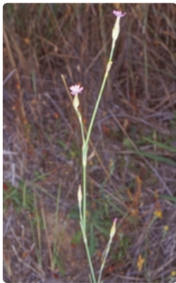
Flowering plant. Photographer Don Wood, Aranda Bushland, Canberra, ACT