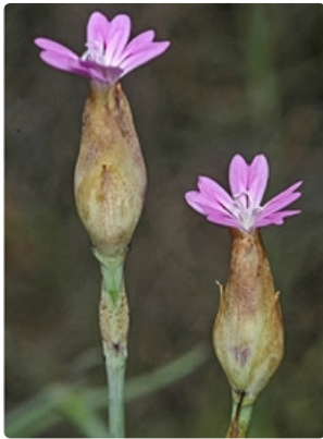
Flower heads. Australian Plant Image Index, photographer Murray Fagg, Scottsdale Bush Heritage Reserve near Bredbo