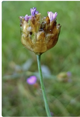
Old flower head. Koorawatha Nature Reserve south of Cowra