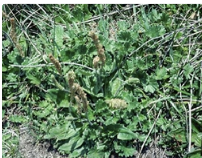
Flowering plants. Australian Plant Image Index, photographer S Donaldson, Namadgi National Park, ACT