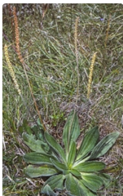
Seedling plant. South East Forests National Park