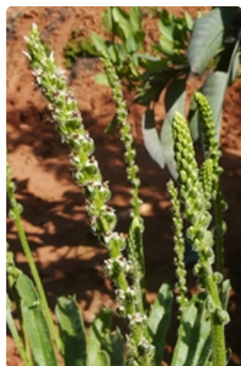
Flowering stems. Scotia Sanctuary, western NSW