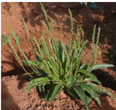
Plant. Photographer Don Wood, Scotia Sanctuary, western NSW