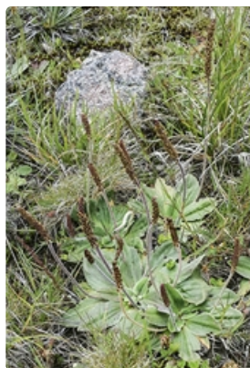
Flowering plants. Bogong High Plains, Vic