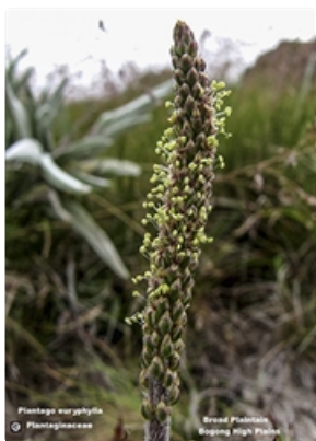
Flower head. Bogong High Plains, Vic