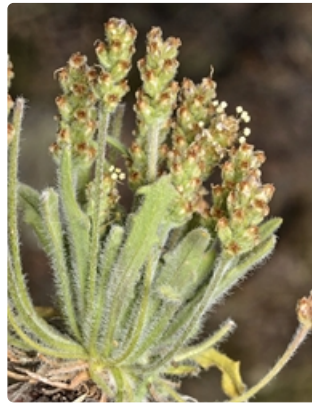
Flowering plant. Scottsdale Bush Heritage Reserve near Bredbo