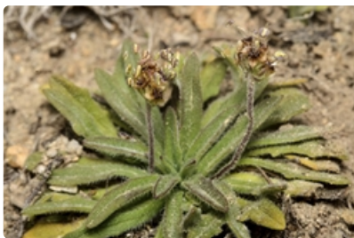
Flowering plant. Namadji National Park, ACT