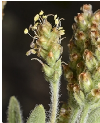
Flower heads. Scottsdale Bush Heritage Reserve near Bredbo