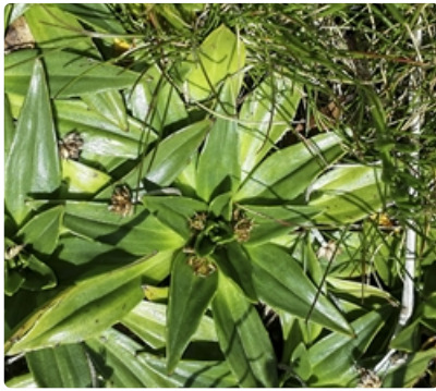
Flowering plant. Photographer Russell Best, Mt Kosciuszko