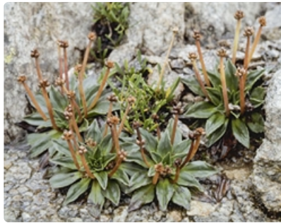
Seeding plants. Mt Kosciuszko summit