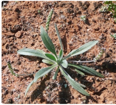
Flowering plant. Scotia Sanctuary, western NSW