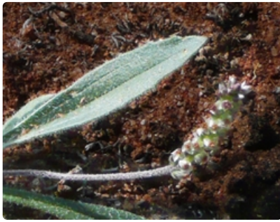
Flowers and leaf. Scotia Sanctuary, western NSW