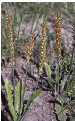
Plants. Photographer Don Wood, Canberra, ACT