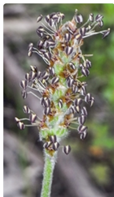
Flower head. Photographer Russell Best, Macedon Ranges, Vic