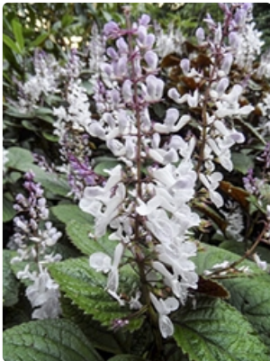
Flowering plants.