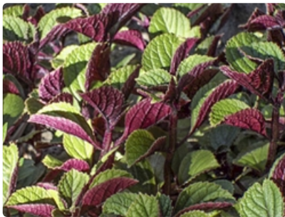
Leafy stems.