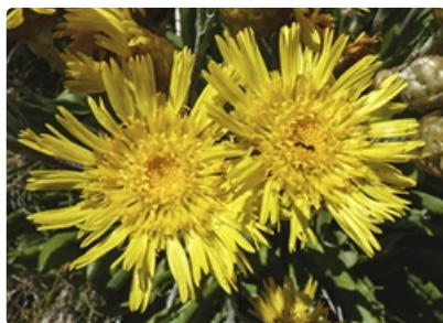
Flower heads.