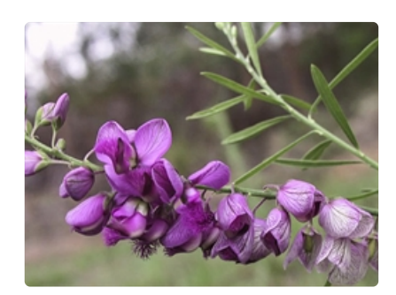
Flowering stem.