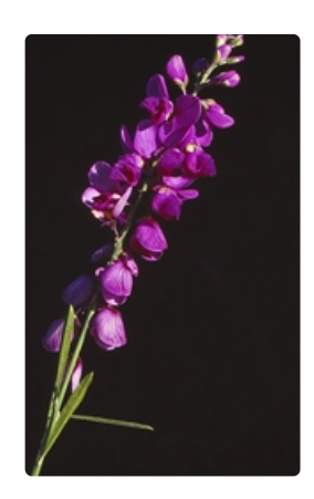
Flow ering stem. near Merimbula