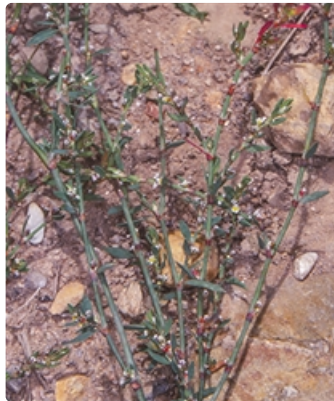
Flowering stems. Tallaganda State Forest NE of Cooma