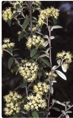
Flowering stems (subsp. andromedifolia ). Jingera Flora Reserve, NW of Eden