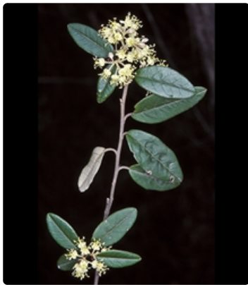
Flowering stems (subsp. confusa ). Nadgee Nature Reserve south of Eden