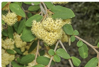
Flowering stems.