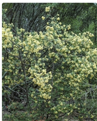
Flowering shrub. Australian Plant Image Index, photographer Murray Fagg, Australian National Botanic Gardens, Canberra, ACT