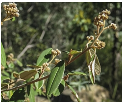
Leafy stems with spent flowers.