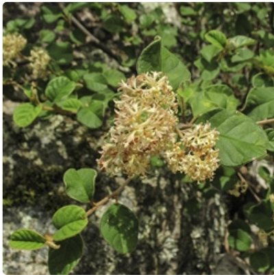
Flowering stem with spent flowers. Tantawangalo Creek NW of Merimbula