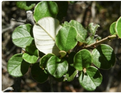
Leafy stems and back of leaf.