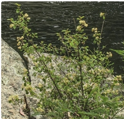
Flowering plant. Tantawangalo Creek NW of Merimbula