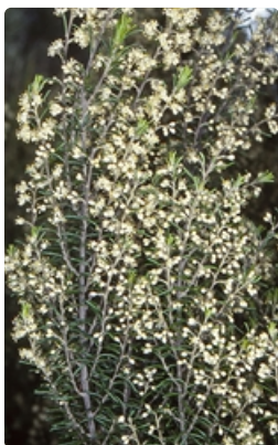
Flowering stems (subsp. ericoides ). Wog Wog Creek, south of Nerriga