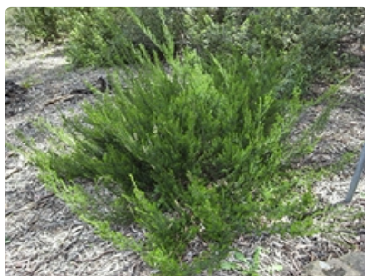
Shrub (subsp. ericoides ).