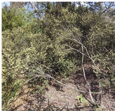
Shrub (subsp. phyllicifolia ).