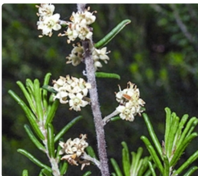
Flowers and leaves (subsp. ericoides ).