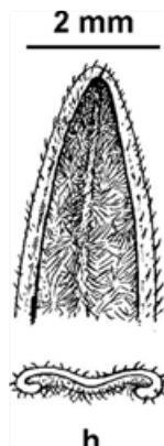
Line drawings (subsp. phyllicifolia ). h. leaf tips (lower surface); leaf transverse section. A. Barley, National Herbarium of Victoria, © 2021 Royal Botanic Gardens Board