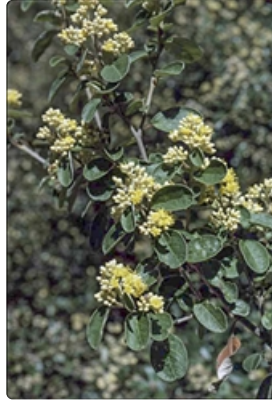
Flowering stems.