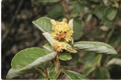
Flowering stem