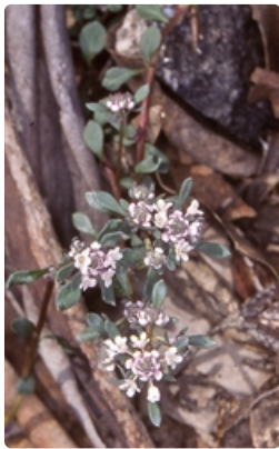
Flowering stems. Namadgi National Park, ACT