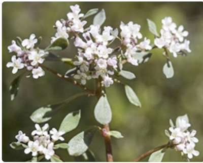
Flowering stems. near Cabrumurra