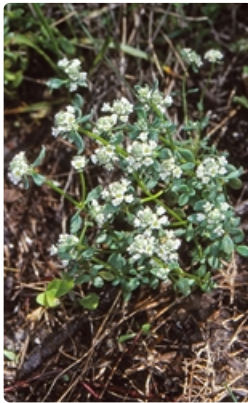
Flowering plant. Namadgi National Park, ACT