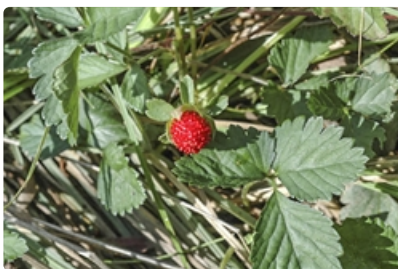
Fruit and leaves. Australian Plant Image Index, photographer Murray Fagg, Canberra, ACT