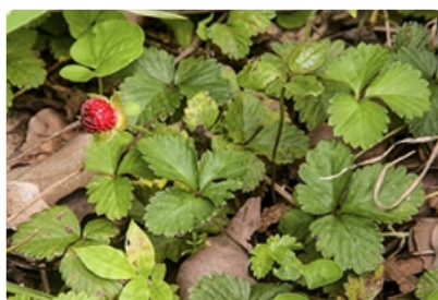
Plant. Photographer Bart Wursten, Zimbabwe