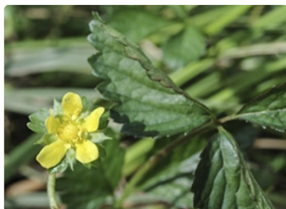
Flower and leaf.