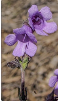
Flowering stem. Kamarrooka, ?State