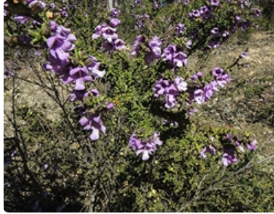
Flowering branches. Brisbane Ranges National Park, Vic