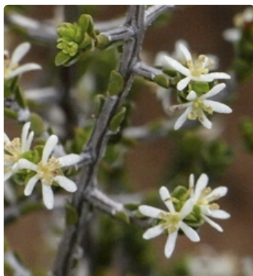
Flowering branches. near Bendigo, Vic