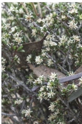
Flowering branches.