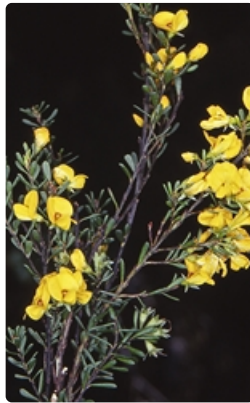
Flowering branch. Kings Highway west of Clyde Mountain