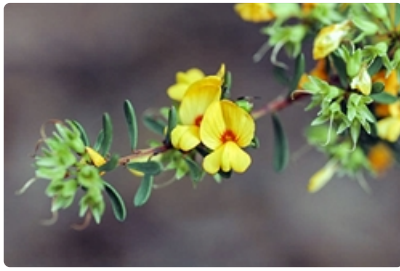
Flowers and leaves. Australian Plant Image Index, photographer Murray Fagg, Australian National Botanic Gardens, Canberra, ACT