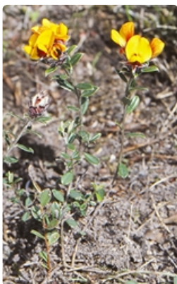
Flowering stems. Namadgi National Park, ACT