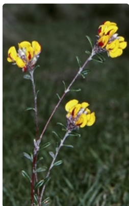
Flowering stems. Two River Plain east of Cooma