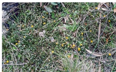
Shrub. Upper Bluegum Creek, ACT