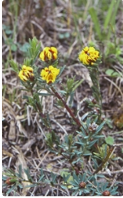
Flowering stem. Coolmooka Nature Reserve near Bombala