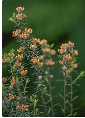
Flowering stems. Australian Plant Image Index, photographer R Hill, Langwarrin, Vic