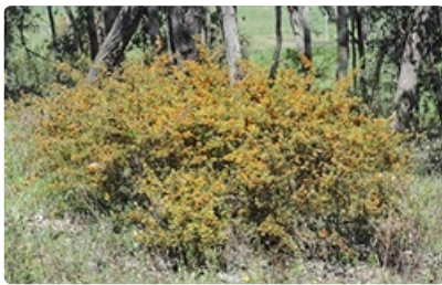
Shrub. between Adelong and Tumut