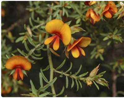
Flowering stems. between Adelong and Tumut