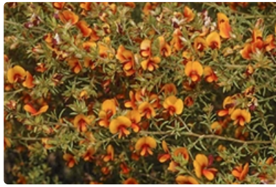
Flowering branches. between Adelong and Tumut