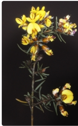
Flowering stems. Photographer Don Wood, Ben Boyd National Park near Eden