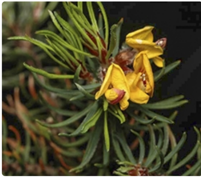
Flowers and leaves.