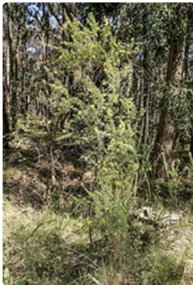
Shrub. Photographer Russell Best, Macedon Ranges, Vic