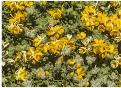
Carpet. Kiandra