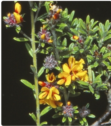
Flowering stems. Namadji National Park, ACT