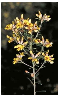
Flowering stem. near Basin View, Jervis Bay