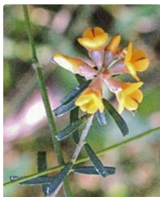
Flowers and leaves. Turbri Wetlands, Tuggerah Lakes