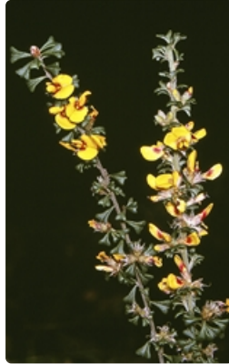
Flowering branch. Ben Boyd National Park south of Eden