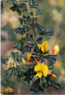
Flowering stem. Macedon Ranges, Vic