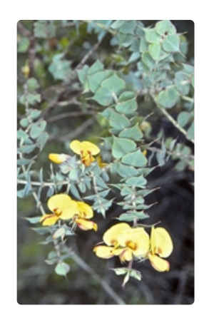
Flowering branches. Yadboro State Forest, west of Uladulla