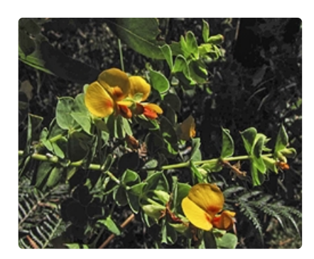
Flowering branches.