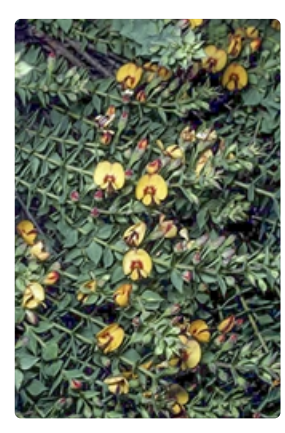
Flowering branches.