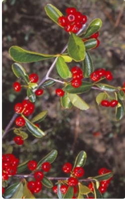
Fruiting stems. near Cotter Bridge, ACT