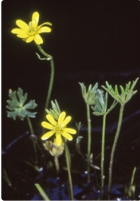
Flowering plant. Photographer Don Wood, Corin Road, ACT