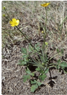
Flowering plant. Eurobodalla National Park south of Moruya