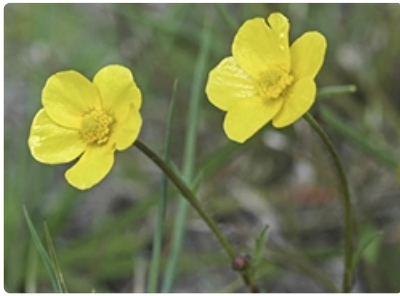
Flowers. north of Young