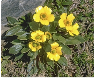
Flowering plants. Kosciuszko National Park