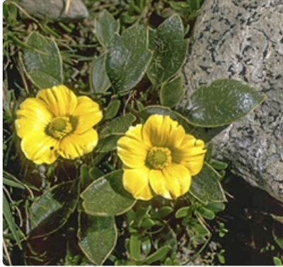
Flowering plants. Kosciuszko National Park