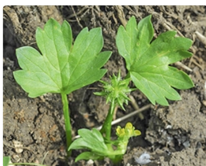
Leaves and seeds.