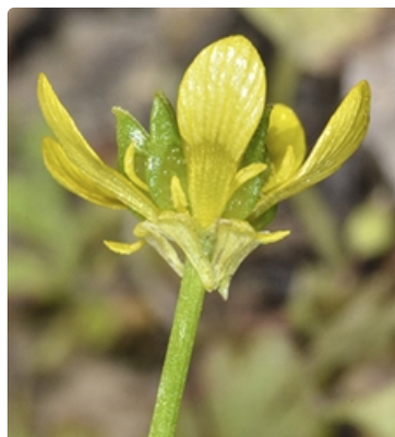
Flower. Photographer Don Loarie, California, USA